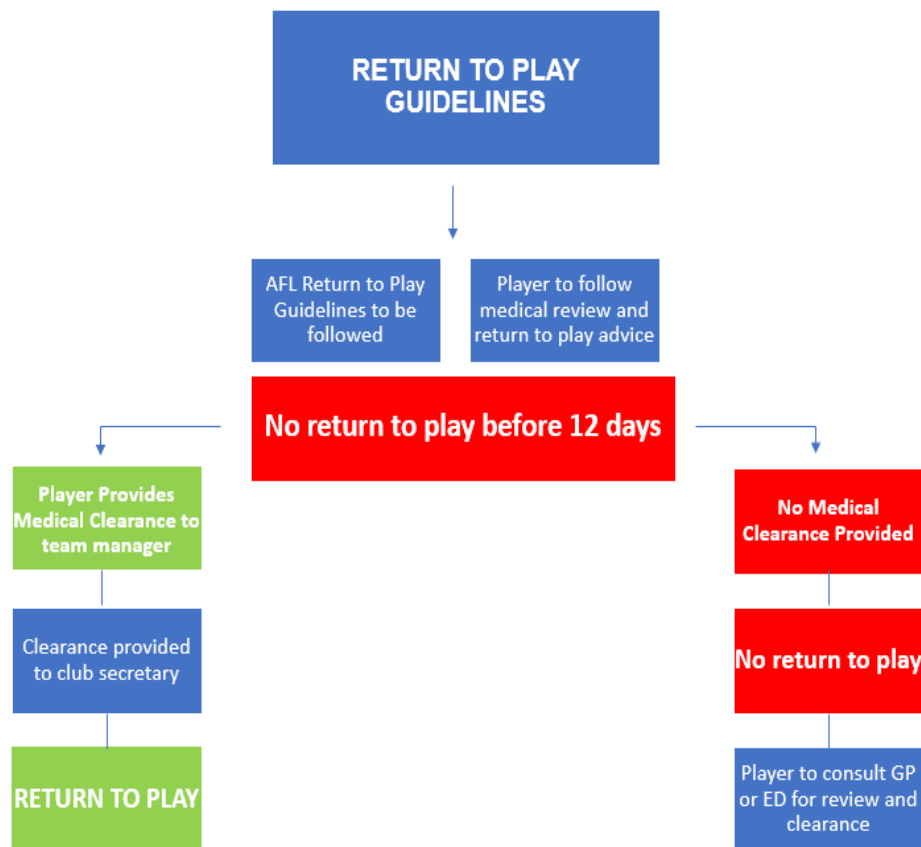
Image 2: Return to Play Guidelines [to be read in conjunction with AFL guidelines]